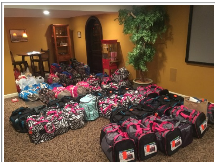
Just a few of the 66 "1st Night bags" donated to CASA by the SJOTM Outreach Committee. Many thanks to those who donated toiletries, blankets and other supplies that fill each bag destined for children in foster care in Somerset, Hunterdon, and Warren counties.